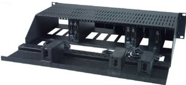
2RU Rackmount Extender Module Tray w/Cable/Power Supply Management Shelf (Standard Feature)