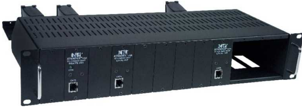
XTENDEX® ST-C5RCK-12 with ST-C5USBVA-300M Extender Modules (Front & Back)

Mount up to 12 USB KVM extender modules into a single 2RU rack tray