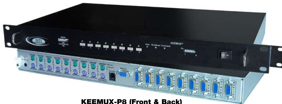
KEEMUX-P8 (Front & Back)

Control multiple PCs with one keyboard, monitor and mouse